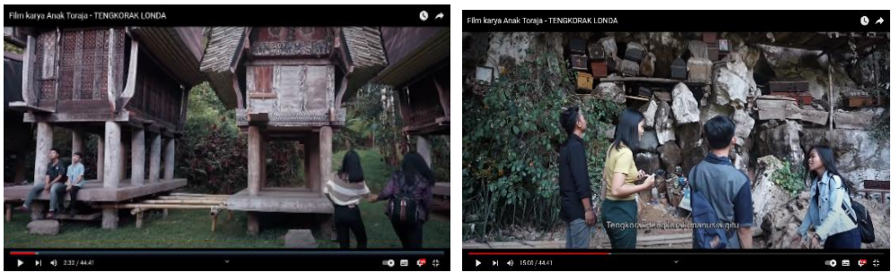
Figure 2. The scene shows the local wisdom present in the film

The two figures above show the local wisdom in the film, for example, a traditional Toraja house seen from the front of the cemetery in the cave.